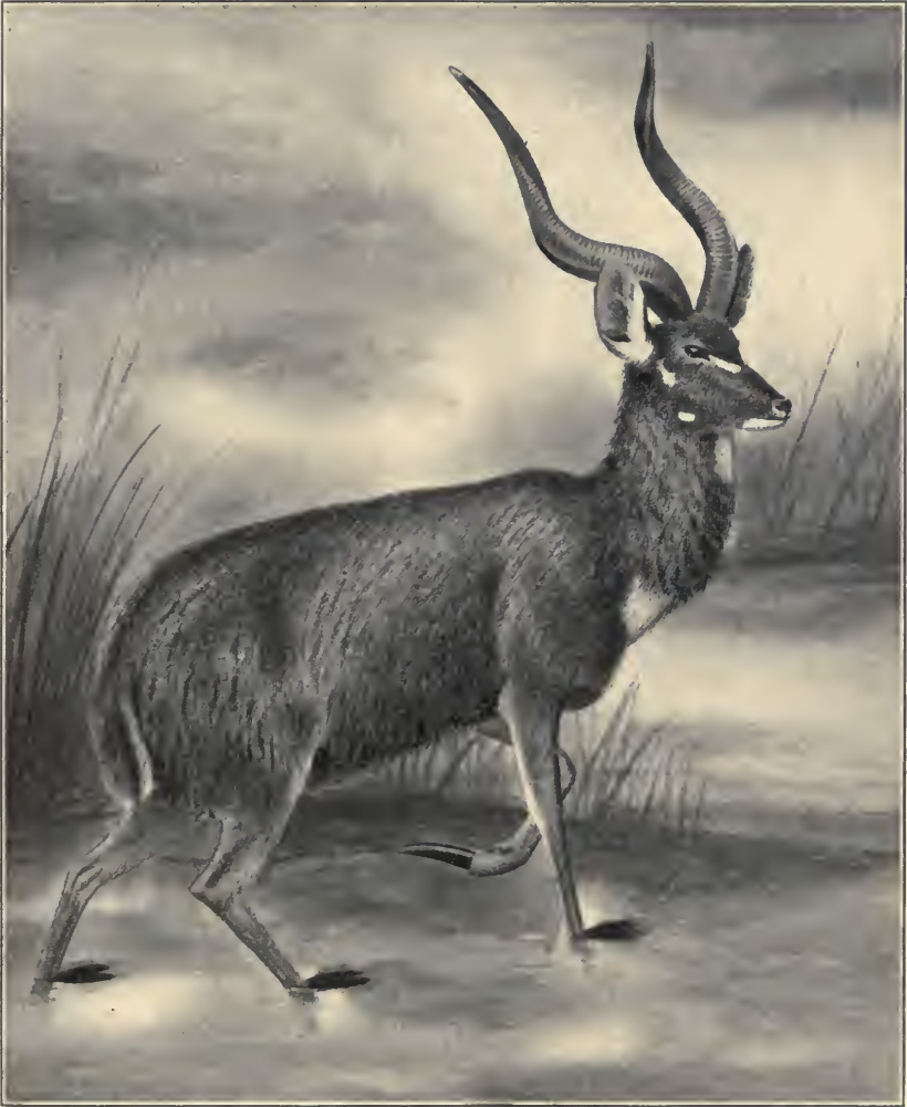
FIG. XIX. LIMNOTRAGUS GRATUS. CONGAN SITATUNGA.

Limnotragus gratus Sclat. & Thos., Book Antel., IV, 1899-1900, p. 165, pl. xcv.